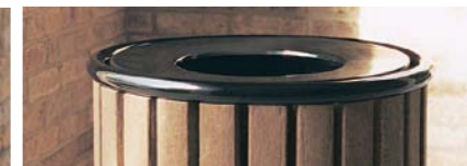
RTH-24 with standard tapered formed lid.