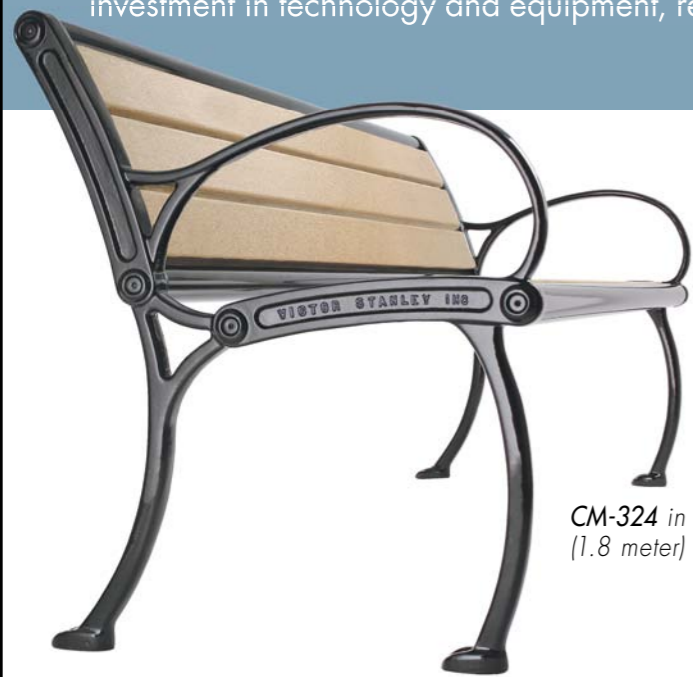
CM-324 in 6 ft. (1.8 meter) length.