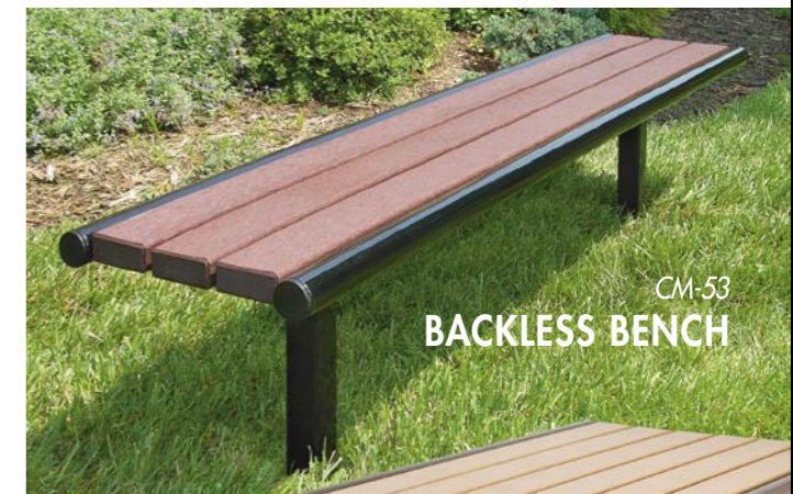
CM-53 BACKLESS BENCH