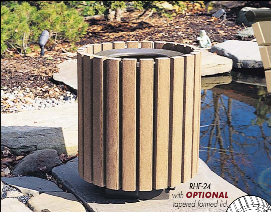
RHF-24 with OPTIONAL tapered formed lid.