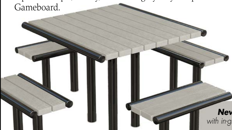
New! CM-4 with in-ground mount.

Options: Maple, cherry, walnut or gray recycled plastic slats. Gameboard.