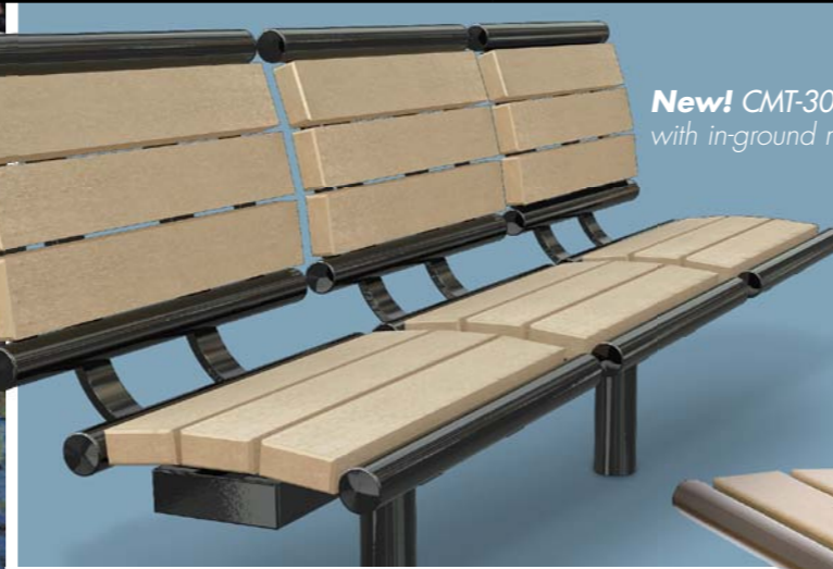
New! CMT-30 with in-ground mount.