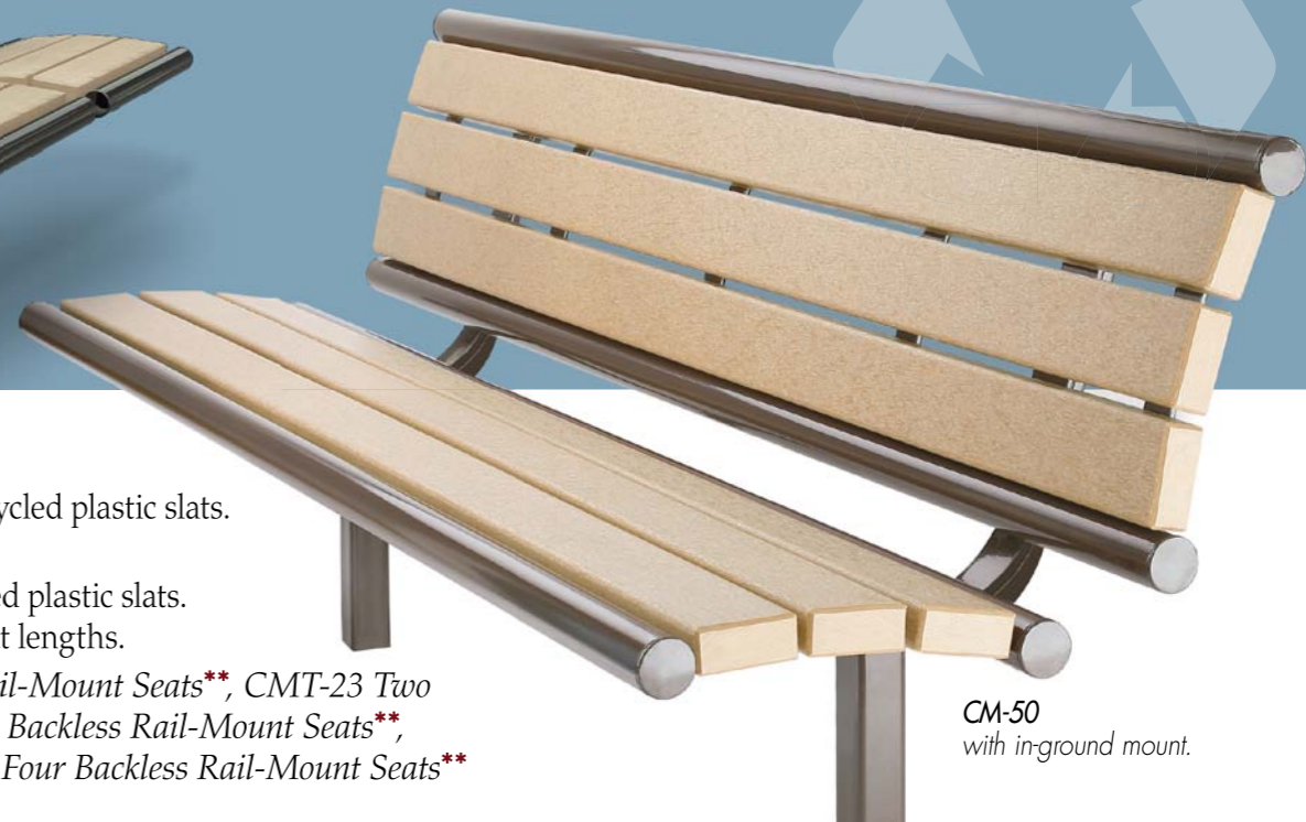
CM-50 with in-ground mount.

PERSONALIZED SLAT ENGRAVING Contact us for details. CM-50 with OPTIONAL engraving shown.