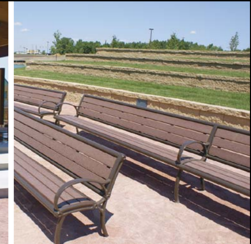
CM-324 in 16 ft. (4.8 meter) length.