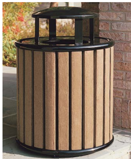
▲ RTH-24 with OPTIONAL dome lid.

Capacity: 36 gallons (136 liters) available (not shown).