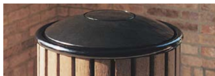
RTH-24 with OPTIONAL convex lid with self-closing door.