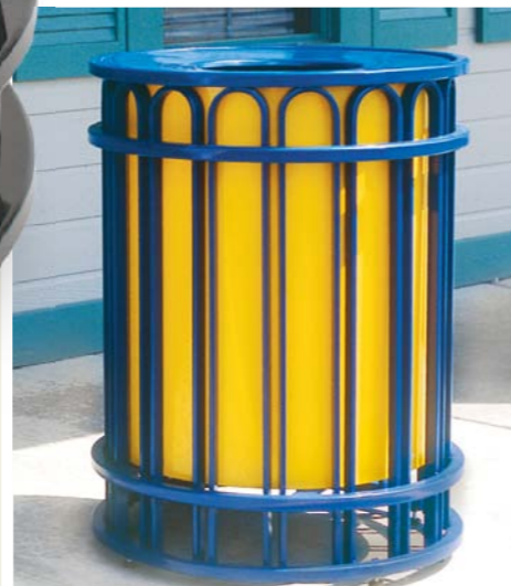
PSA-32 with OPTIONAL 2-color configuration (blue frame and lid, custom yellow interior sleeve).