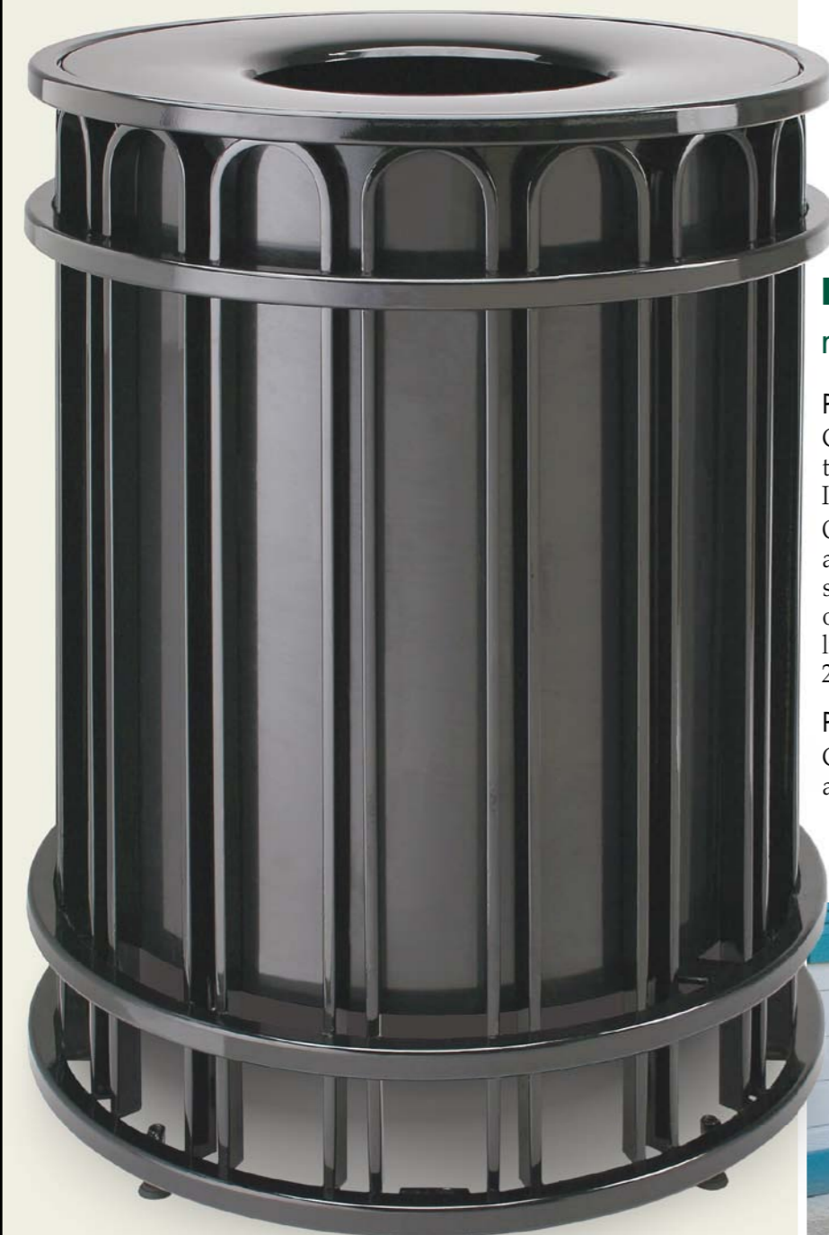
PSA-32 with black frame, lid and interior sleeve.