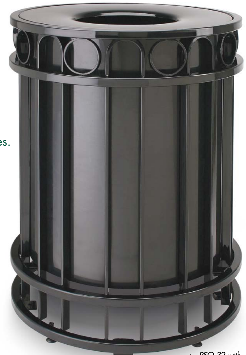
▲ PSO-32 with black frame, lid and interior sleeve.