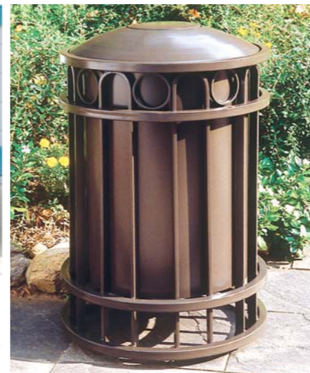
PSO-24 with OPTIONAL convex lid with self-closing door.