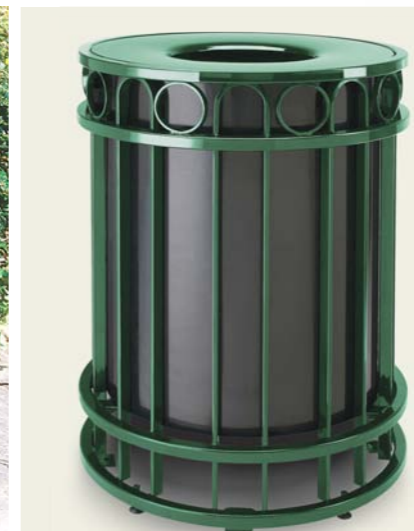
PSO-32 with OPTIONAL 2-color configuration (green frame and lid, black interior sleeve).