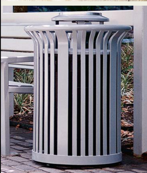
ES-335 with OPTIONAL dome lid with ashtray.