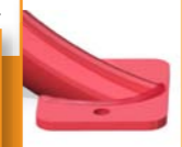
BRHS-101 surface mount.

Surface mount: all Cycle Sentry™ except BRHS-101, BRNS-301.